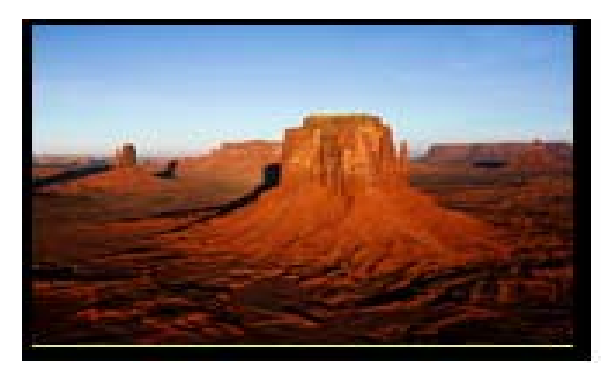
Fig1. Uploading Image

We have used text based search as initial step just to obtain images from popular search engine and the user is required to select query input from set of images. A database has been maintained at server side manually by using some predefined set of properties like image id, image type, name, colour behaviour etc. For example consider the following image