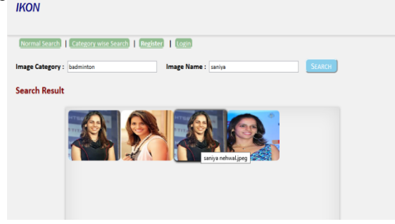
Fig 5. Intended output shown by system

4) Images shown by system are relevant to the query but still system can't recognise user intention exactly so next step is –user has to select one image out of result and next output will be relevant set of images only.