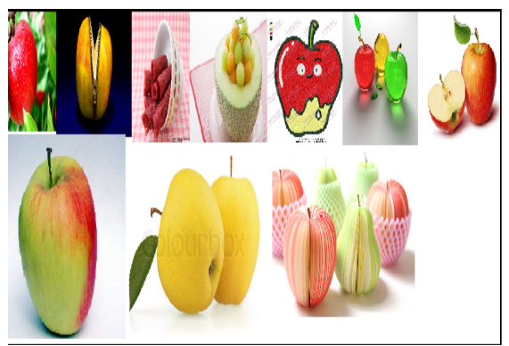
Fig 2 shows the query apple of images and showing duplication.

There are popular web search engines are like Google search engine or Bing search engine uses text and visual information method to retrieve relevant images from database. User has to type text query on Bing search engine and based on that result user gets relevant images. But there is one drawback that all retrieved images are not relevant to text query .this is the output of Bing search engine when we entered query apple as a fruit. Still we get irrelevant set of images. Also the retrieved images contain repeated images in result as shown below.